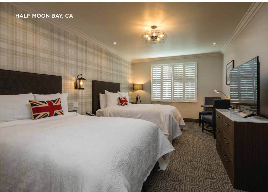
HALF MOON BAY, CA