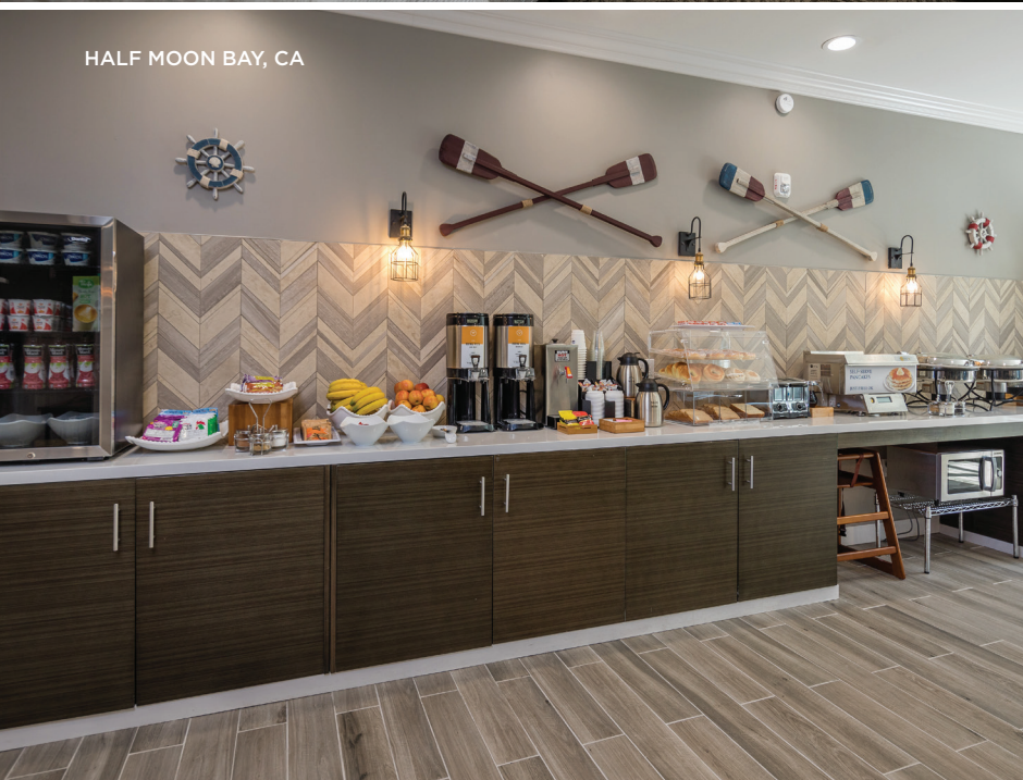
HALF MOON BAY, CA

*Numbers are approximate, may fluctuate and include hotels currently in the development pipeline.